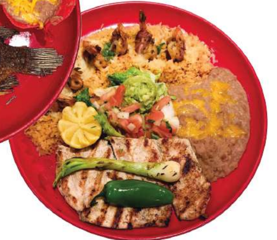
MAR & POLLO