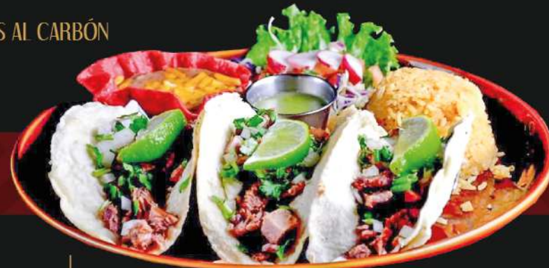
TACOS AL CARBÓN

3 Traditional Mexican tacos made with beef and garnished with cheese, cilantro and onions. Served with consommé, also bean and rice | 18.00