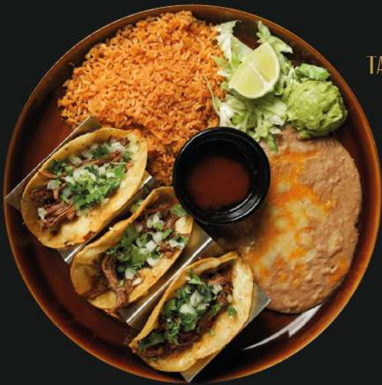
TACOS DE BIRRIA

Crispy corn tortillas filled with shredded beef and pork or chicken and garnished with tomatoes, lettuce, Cotija Mexican cheese, sour cream and guacamole | 13.25