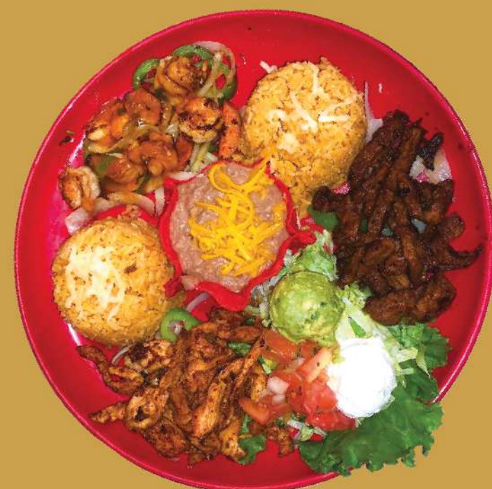
Fajitas Sampler Chicken, beef and shrimp marinated in Torero's special recipe over a bed of sautéed onions and green peppers. Served with pico de gallo, sour cream, guacamole, refried or rancho (cholesterol-free) beans, Mexican rice and hot tortilla. Garnished with lettuce and tomatoes | 22.25

* Consuming raw or undercooked meat, poultry, seafood, shellfish or eggs may increase your risk of food borne illness, especially if you have certain medical conditions