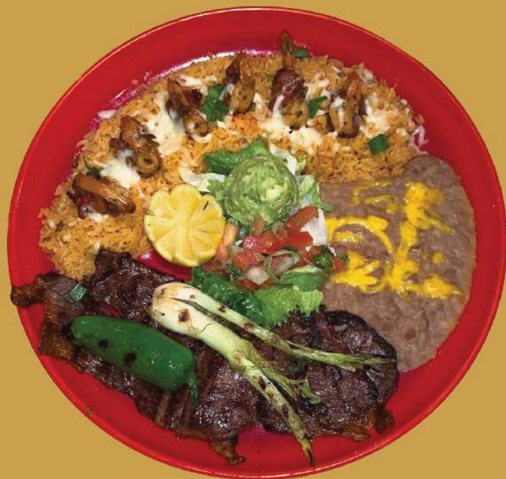
Mar y Tierra Shrimp wrapped in bacon and baked in our special butter recipe, topped with Monterey Jack cheese and accompanied by skirt steak grilled to perfection. Served with Mexican rice, beans, guacamole, pico de gallo and hot tortillas | 24.25