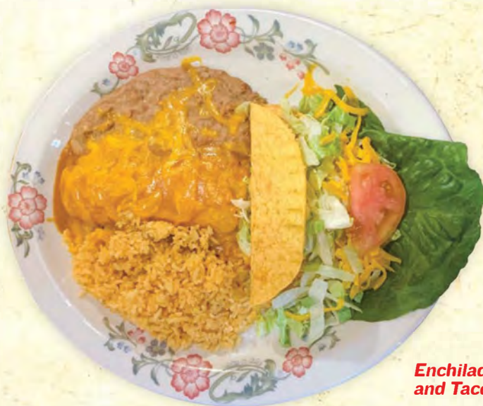
Enchilada and Taco

Ranchera and Suiza come with sour cream.