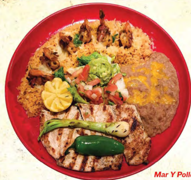
Mar Y Pollo

Your choice of shrimp or scallops sautéed with mushrooms in butter, garlic and spices. Served with Mexican rice, beans and your choice of corn or flour tortillas. 14.00